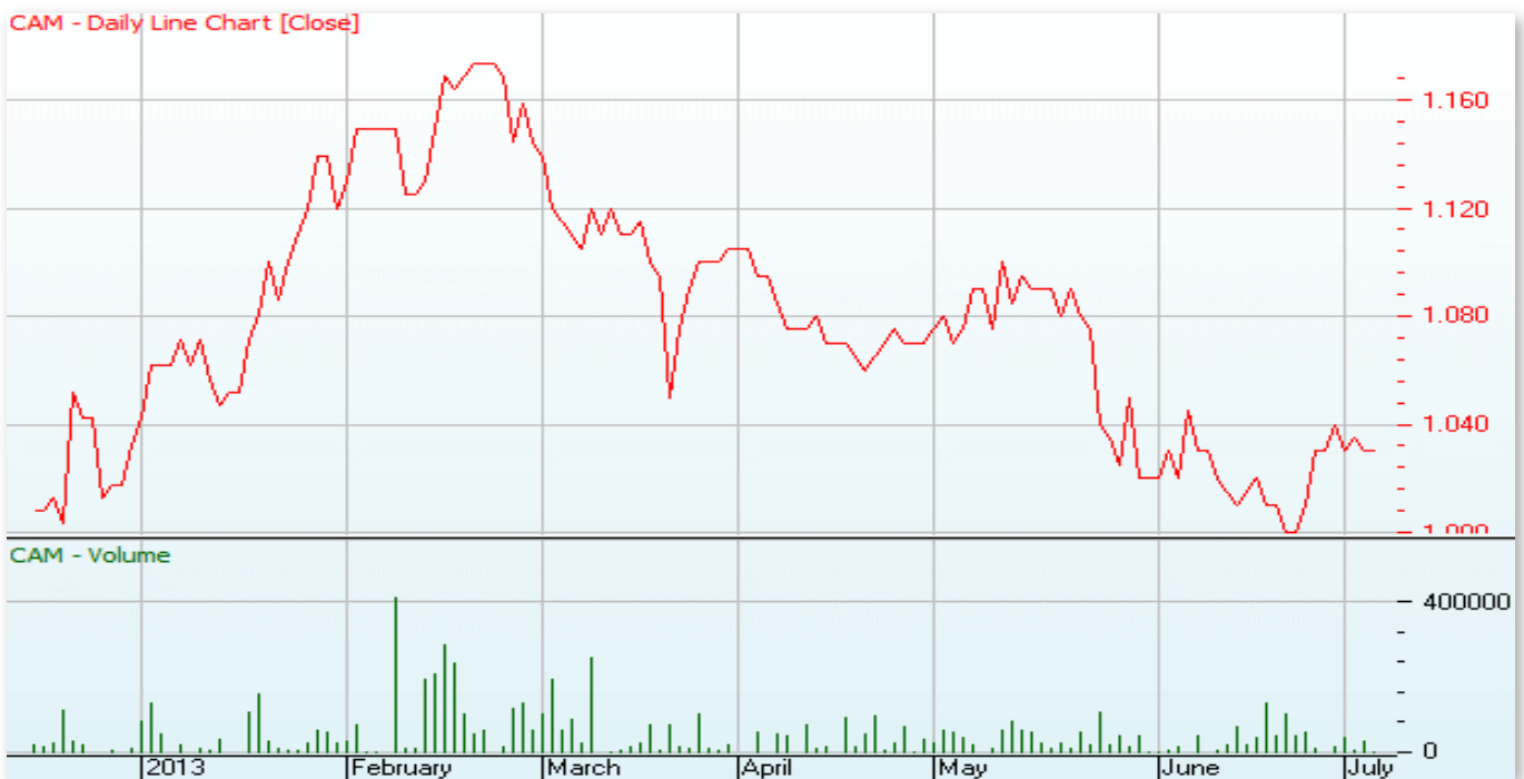
Figure: CAM Daily Line Chart

Copyright © 2013 Clime Capital Limited (ASX:CAM). All rights reserved. The information provided in this email and climecapital.com.au is intended for general use only. The information presented does not take into account the investment objectives, financial situation and advisory needs of any particular person nor does the information provided constitute investment advice. Under no circumstances should investments be based solely on the information herein. Climecapital.com.au is intended to provide educational information only. Please be aware that investing involves the risk of capital loss. Data for graphs, chart and quoted indices contained in this report has been sourced by IRESS Market Technology, Thomson Reuters, Clime Asset Management and MyClime unless otherwise stated. Past performance is no guarantee of future returns.