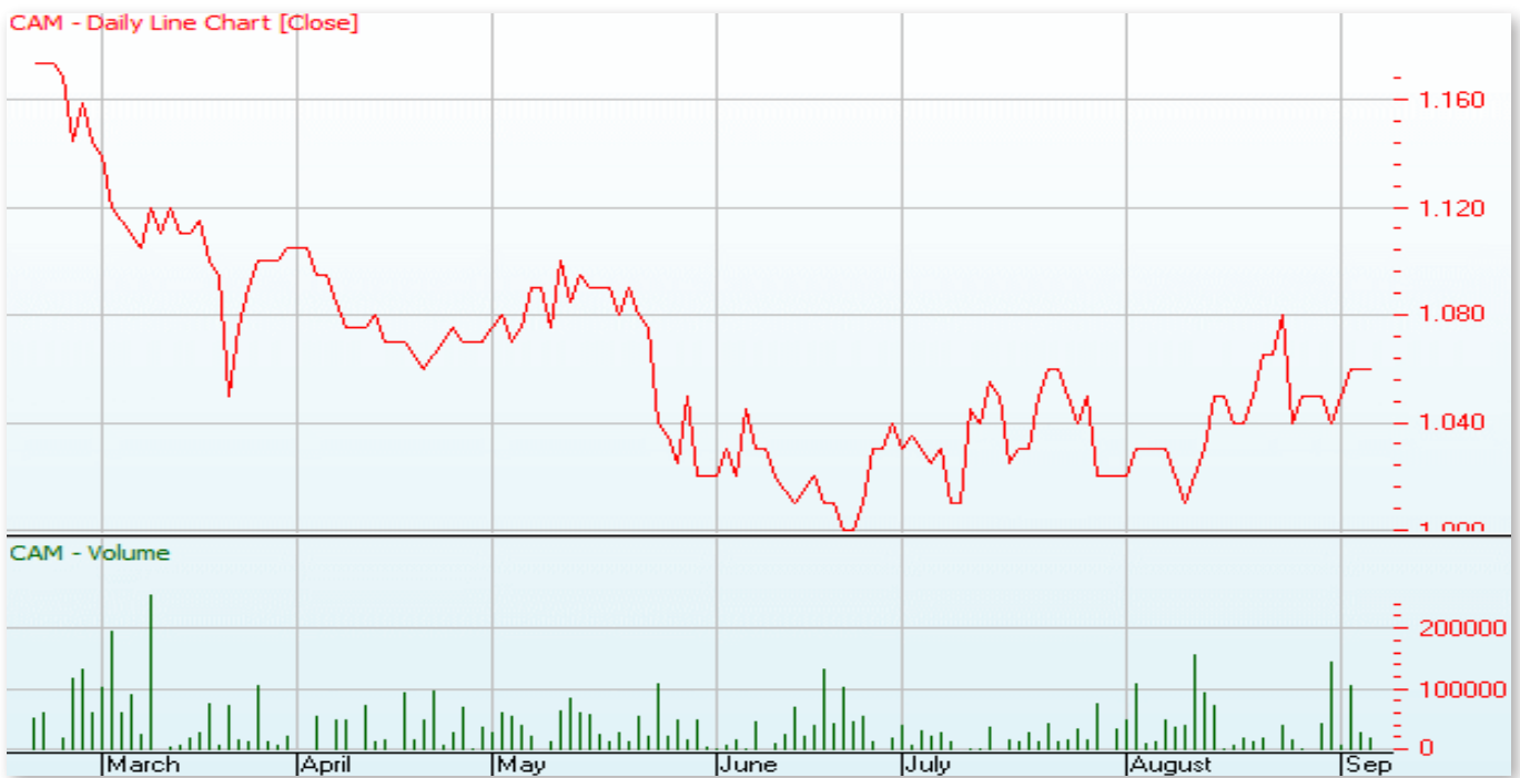
Figure: CAM Daily Line Chart

Copyright © 2013 Clime Capital Limited (ASX:CAM). All rights reserved. The information provided in this email and climecapital.com.au is intended for general use only. The information presented does not take into account the investment objectives, financial situation and advisory needs of any particular person nor does the information provided constitute investment advice. Under no circumstances should investments be based solely on the information herein. Climecapital.com.au is intended to provide educational information only. Please be aware that investing involves the risk of capital loss. Data for graphs, chart and quoted indices contained in this report has been sourced by IRESS Market Technology, Thomson Reuters, Clime Asset Management and MyClime unless otherwise stated. Past performance is no guarantee of future returns.